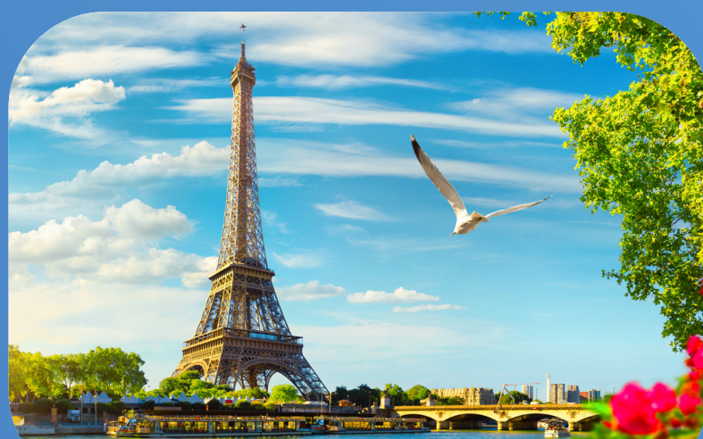
PARIS OLYMPICS TARGET